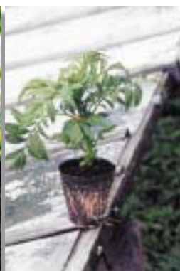
▲ Rose d'Inde (Dreux)