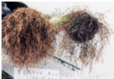
Comparison root development ▶

2 – When a plant grown in a FERTILPOT is planted or repotted (without removing the pot), the dormant root buds set during aerial containment are immediately activated. There is no shock from transplanting, this difference is particularly marked when ground conditions are difficult (cold, drought, adverse season, etc.). Finally, as there is no deformation in the root system, the plant establishes easily and settles into the soil quickly.