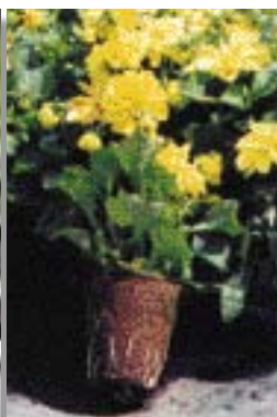
▲ Dahlia (Vitry-sur-Seine)