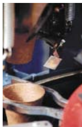
Automatic destacking with FERTILPOT ◀

The speed at which it degrades depends on different parameters, primarily linked with the intensity of microbial activity. With spring planting in a temperate climate, only a few fragments of the wall will still be visible after a few months.