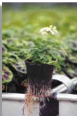
▲ Pélarгонium (Etampes)